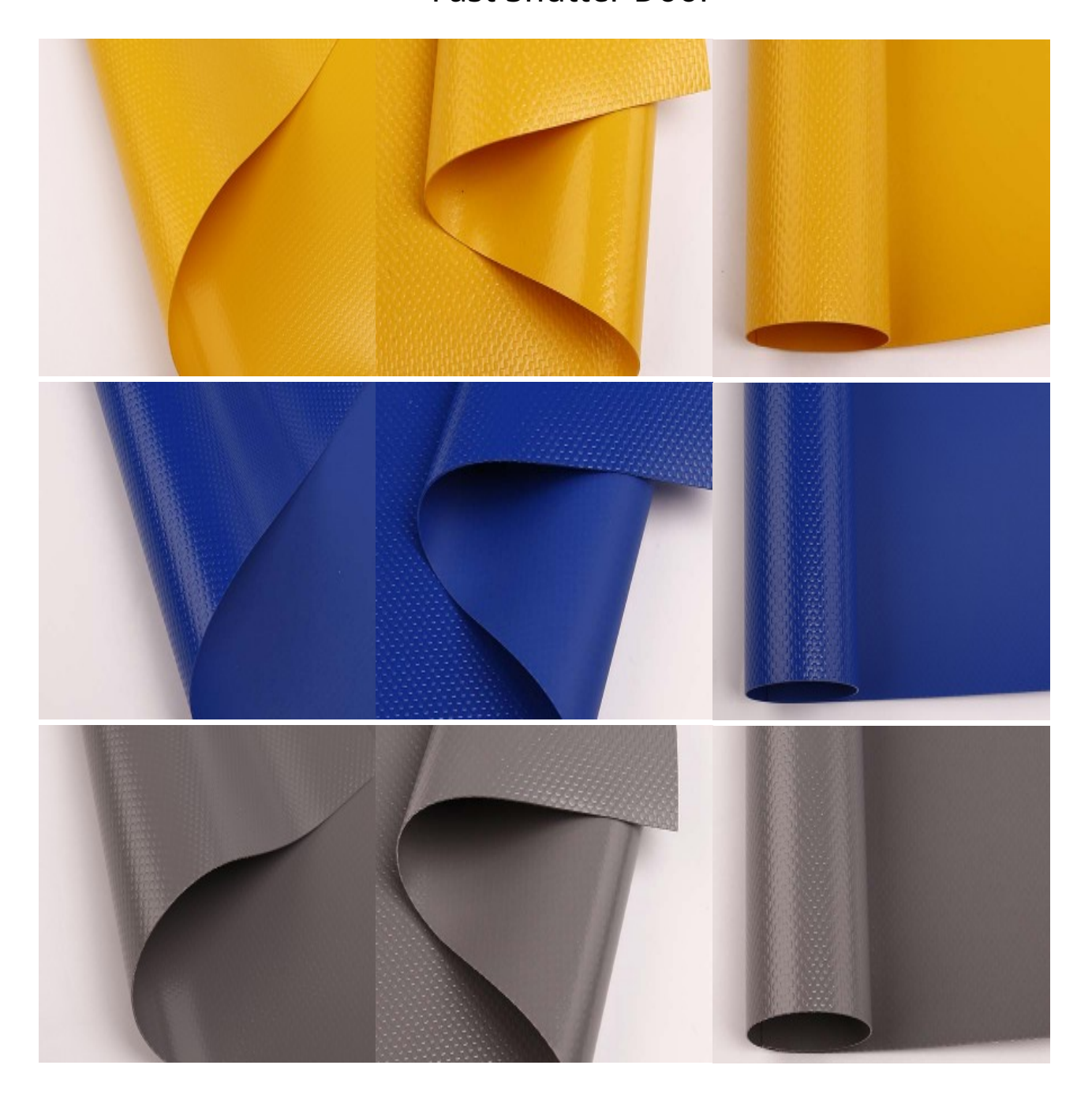
Fast Shutter Door